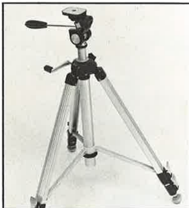
Above: 16695 Field Tripod

Unitron Model SC Spotting Scope as follows: 80mm Spotting Scope with prismatic single eyepiece holder and helical fine focus control. One eyepiece: 20X. Felt-lined quick release clamp threaded for tripod attachment. (Tripod not included. We suggest using Model SC Spotting Scope with the accessory Field Tripod, or "C" Clamp listed below. Wood cabinet available as accessory.) . . . $90.00