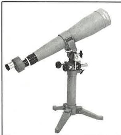
Above: 16537 Model S Spotting Scope

Unitron Model QC Spotting Scope as follows: 80mm Spotting Scope with 45° prismatic revolving quadruple eyepiece holder and helical fine focus control. Four eyepieces: 20X, 30X, 40X, 60X. Felt-lined quick release clamp threaded for tripod attachment. (Tripod not included. We suggest using Model QC Spotting Scope with the accessory Field Tripod, or "C" Clamp listed below. Wood cabinet available as accessory.) . . . $142.00