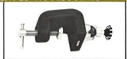
Above: 16696 "C" Clamp

16694 WOOD CABINET for Models S and SC Wood cabinet with handle for portability, and storage. Holds Spotting Scope, quick release clamp and table tripod. . . . $17.00