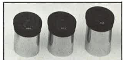
Above: Interchangeable Eyepieces