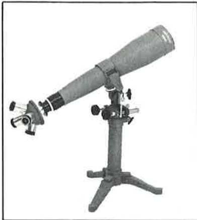
Above: 16536 Model Q Spotting Scope

meet individual preferences, several models of Spotting Scopes are offered as listed below. A variety of interchangeable and optional accessories expands versatility still further. Additional accessories are planned for future offering.