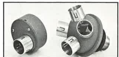
Single & Quad. Eyepiece Holders