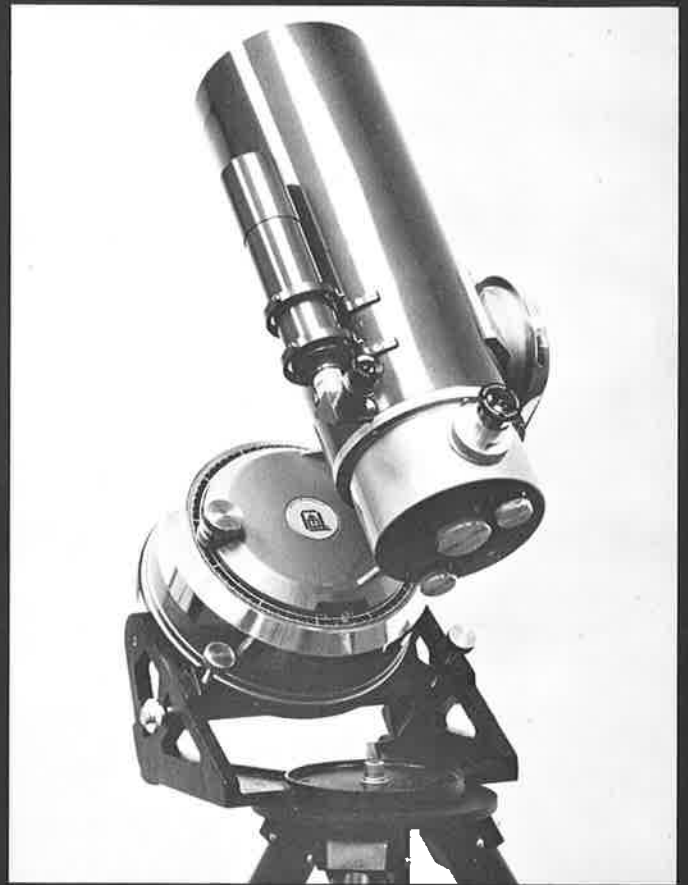
QUANTUM SIX SHOWN ON FOLDING TRIPOD AND WEDGE ASSEMBLY