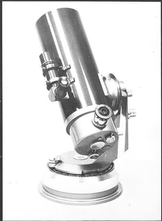
THE QUANTUM FOUR

Davis & Sanford Model B with Rising Center Post and MH-3 Pan Head with Quantum Adapter... $228.50 Photo-Barlow Lens, 2x ..... $48.00 Solar Filter, Full Aperture ..... $187.50